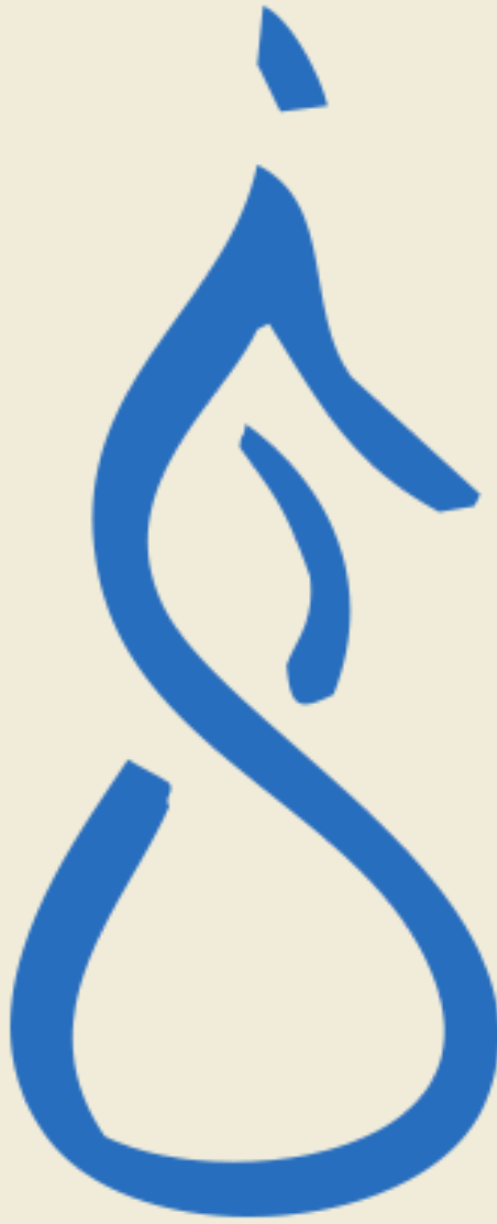
Ondina - Water

Sigils and rituals which involve water element are quick to manifest. Cleansing sigil or ritual for example.